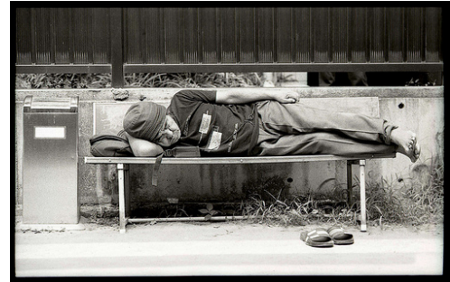
Figure 1. Homeless in Sugamo [3]

Homelessness is a significant problem in many nations where numerous people lack a permanent, safe place to spend their nights. Many of these people lack enough income to pay for housing. Some have drug addictions that prevent them from holding down a job, while others have simply come upon hard luck in the form of foreclosure or medical problems [1].